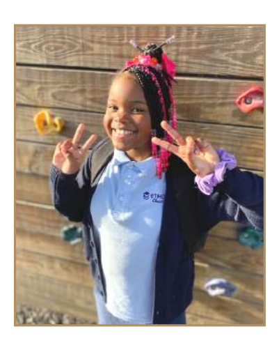
We are unique individuals with the ability to showcase our personality proudly!