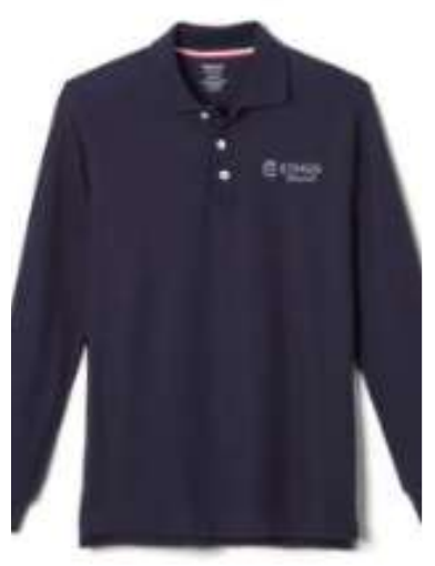
*Available June 2023