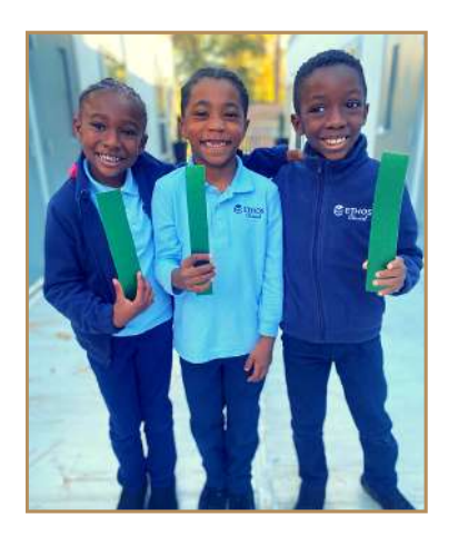
We are members of a team that is focused only on growing our brains!