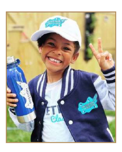
We celebrate our wins and school culture by wearing items that reflect our successes!